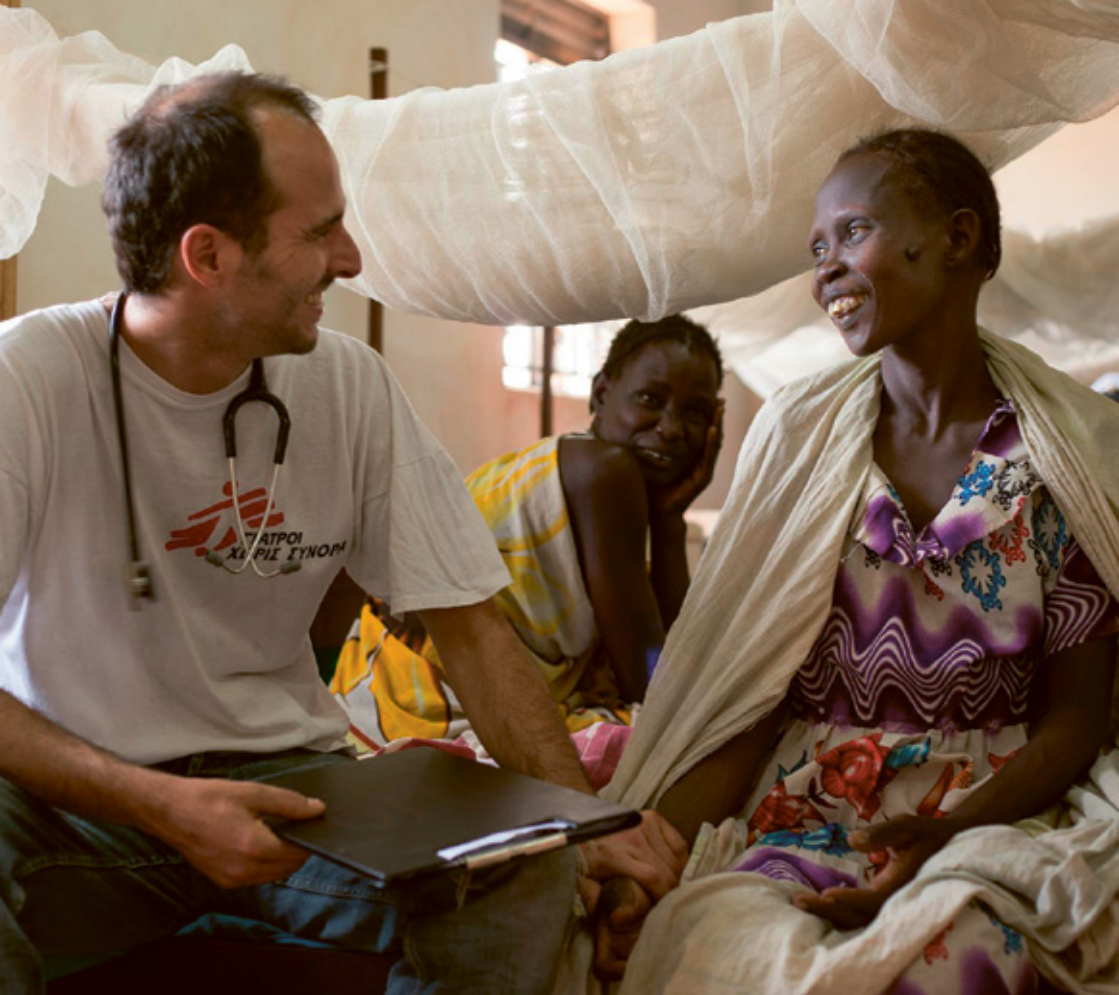
Medecins sans frontieres / Doctors without borders, www.msf.org.uk/get-involved